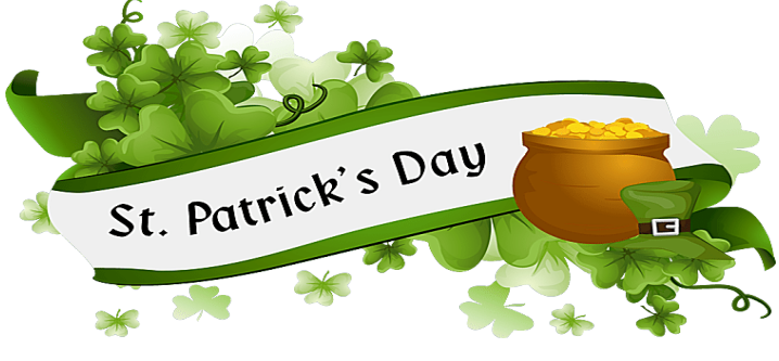
Happy Easter and St. Patrick's Day to you and your family from us ALL here at Tecumseh Place.